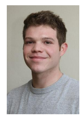
Lee's Summit, Missouri

This research project characterizes the texture, morphology, composition, mineralogy and geochemical of dune sediments from the Al-Jafr Basin, Jordan. The research consists of the first dune samples to be analyzed from the largest basin on the Jordan Plateau. Using various analytical methods reveal the paleoenvironmental processes dominating landscape formation at this location. Microscope examination revealed presence of vegetation and fossils. Grain size results throughout the sand dune samples identified the sediment as predominately silt size particles, predominately fine silt. This indicates moderate and steady wind energy to transport these particles.