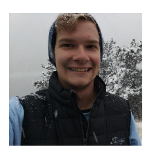
St. Louis, Missouri