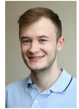
Kansas City, Missouri

Participants who were rejected by their partner chose to eat healthy and unhealthy foods less. Per the literature surrounding stress research, rejected participants were expected to eat more unhealthy foods; however, they demonstrated restricted eating behaviors after stress exposure. It was likely that the nature of the stress in this experiment, the stress stemming from the social rejection by first impression, might have guided the individuals to turn their attention inward, causing them to selfconsciously restrict their eating.