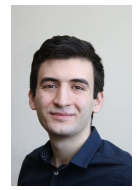
Ankara, Turkey residing in Kansas City, Missouri

How does education level impact a person's perception of corruption within their state? In this study, we draw on cross-national and crosstemporal survey data of 30 European states which was produced by the Inter-University Consortium for Political and Social Research (ICPSR) and Leibniz Institute for the Social Sciences (GESIS). We examine the relationship between education levels and perceived corruption in 24,276 responses. We find that there is a statistically significant negative relationship between a respondent's level of education and the corruption that they perceive in their state. Moreover, we found that there is no significant effect of education on perceived political corruption.