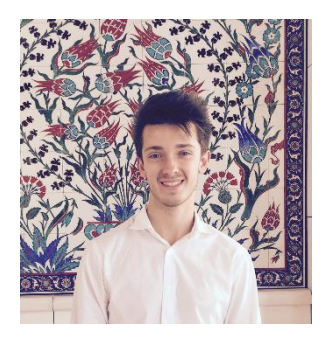
St. Charles, Missouri

We apply our ARA methodology in a real-world mobile cloud computing application, Panacea's Cloud, using experiments and simulations to show how we streamline information flows for disaster response coordination. ARA is shown to be an effective framework for improving disaster management outcomes during a pilot test with Task Force Once, Missouri's leading disaster response team. Specifically, ARA is shown to decrease disaster response time by nearly fifty percent compared with current response practices.